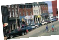
Shopping Kittery Outlets