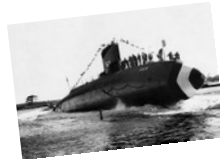
Naval History & Museums