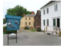
Strawberry Banke Museum